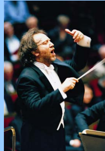
Riccardo Chailly conducts the world-famous Gewandhaus Orchestra.