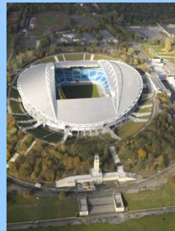
Leipzig's Central Stadium is one of twelve match venues for the World Cup. On 9 th December the draw will take place to decide which teams from around the world will fight it out here in the summer.