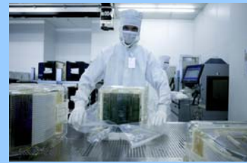
AMD, an American company that makes semiconductors, has started up its "Fab 36" in Dresden – one example of good location policy in Saxony.