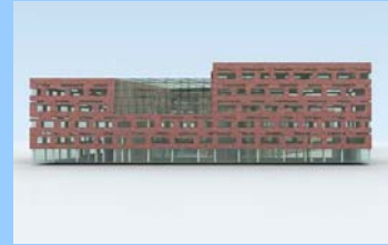
Business, science and research work together in a close network at BIO CITY LEIPZIG .